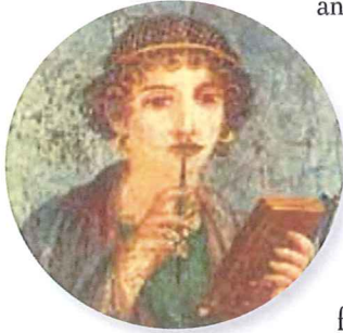
This painting from the ruins of Pompeii shows how widely wax tablets and styluses were used to record thoughts in written form.

and how consistent these traditions remained. Even though Paul wrote in Greek, he called the apostle Peter by his Aramaic name, “Cephas.” Then, there’s the repeated phrase “and that.” The phrase rendered “and that” is the Greek translation of an Aramaic method for joining clauses. 11 Based on the grammatical patterns in these verses, it’s clear that this oral history originally circulated in Aramaic. And where did people speak Aramaic? In Galilee and Judea, the places where Jesus walked and talked, died and rose from the dead! And when could Paul have received an oral history of the death and resurrection of Jesus in Aramaic? The point at which Paul seems to have learned this version of the historical account was around AD 35 when he visited Jerusalem and heard the story of Jesus from an eyewitness (Galatians 1:18). For Paul to have received a consistent oral history in Aramaic at this time, scholars estimate that this account—a tradition that clearly affirms the essential facts of Jesus’ resurrection—first surfaced near Jerusalem shortly after Jesus was crucified. 12